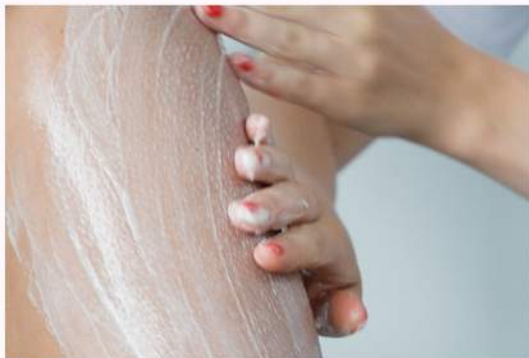
anti cellulite balm application

What is more, the procedure helps to increase metabolism along with caloric burn, it smoothes and moisturizes the skin and intensifies cryostimulation effects.