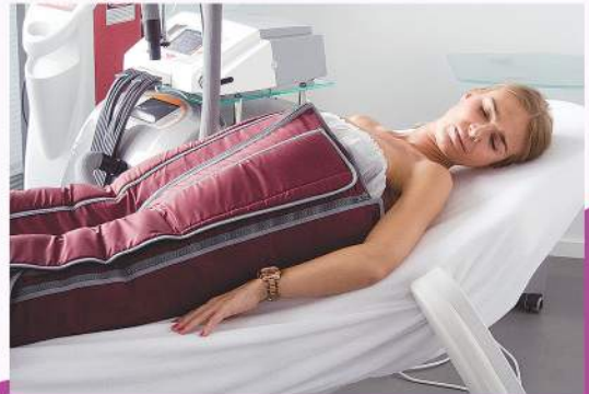
pants with 24 overlapping chambers

BOA Max 2 - 24 outlets 12 individual and 6 predefined algorithms, individual adjustment of pressure, gradient, cycles